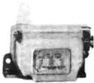
Spring Return Pull Lever, Type PSKU-110CE