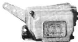
Spring Return Pull Lever, Type PSKU-110CO