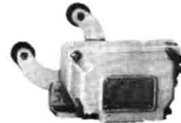
Maintained Fork Lever, Type PIKU-110