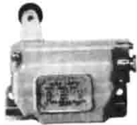
Spring Return Roller Lever, Type PSKU-110C

unloaders and large industrial machines, used in severe atmospheric conditions.